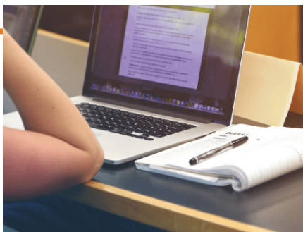
ETS ParaPro Assessment Exam Prep

Prepare to pass the ETS ParaPro Assessment Exam required to be a Paraprofessional by taking our Teacher's Aide with Paraprofessional Prep Course (130 hours self-paced online).